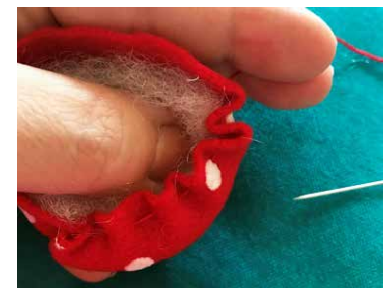
Figure C Figure D