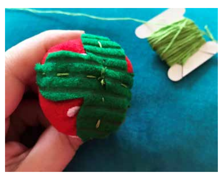
Figure E Figure F